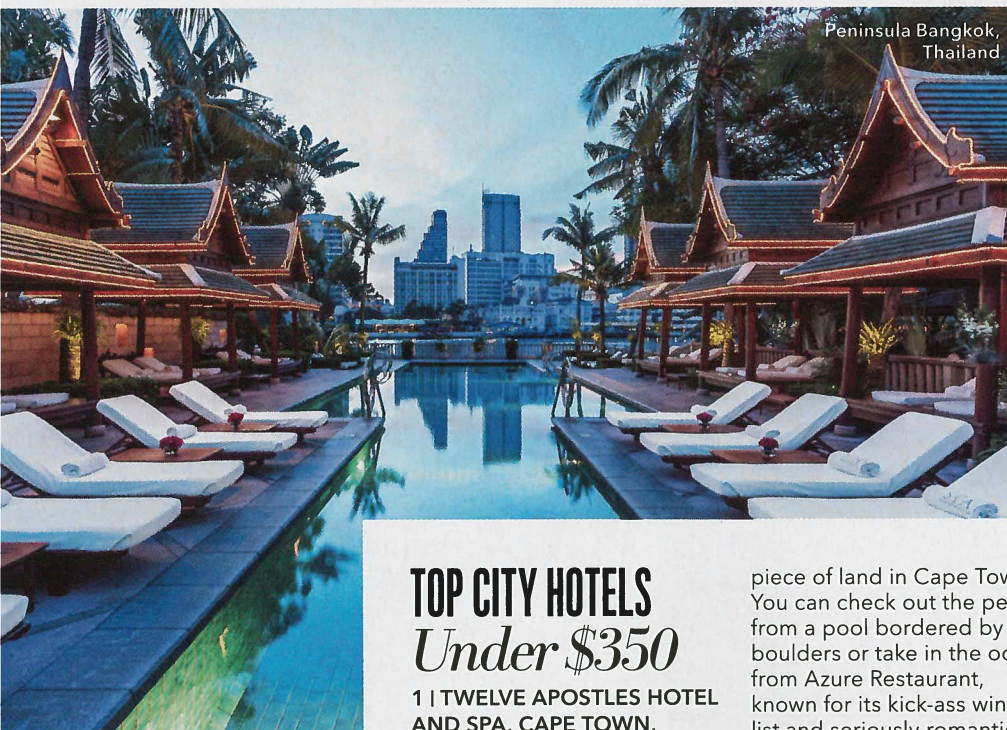
Peninsula Bangkok, Thailand

5 | DAINTREE ECO LODGE & SPA, QUEENSLAND, AUSTRALIA Doubles from $243; daintree-ecolodge.com.au.