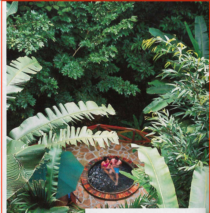
Nayara Hotel, Spa & Gardens, Costa Rica

5 | JW MARRIOTT PHUKET RESORT & SPA, THAILAND Doubles from $160; jw.marriott.com.